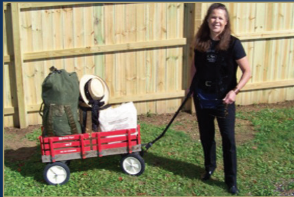
JUVENILE FICTION / Legends, Myths, Fables / Native American

The old traditional stories are told in a manner similar to Aesop's Fables with the story having a moral. The elders tell us that the same stories will have different meanings throughout different stages of life. It is up to the readers to decide the meanings of these new stories such as "The Christmas Potato."